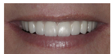
Builds back smile